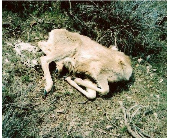
Hundreds of starving mule deer fawns died on top of adequate winter forage covered with deep, crusted snow in some parts of Idaho. (April 6, 2008 photo by Harvey Peck)

Those statements ignore wild ruminant biology and illustrate the hands-off management agenda preached by AFWA and its nongame/wildlands co-conspirators. The claim that mule deer don't require supplemental nutrition to survive when their feed is covered by 18 or more inches of snow and ice reflects a combination of ignorance, dishonesty and absence of logic.