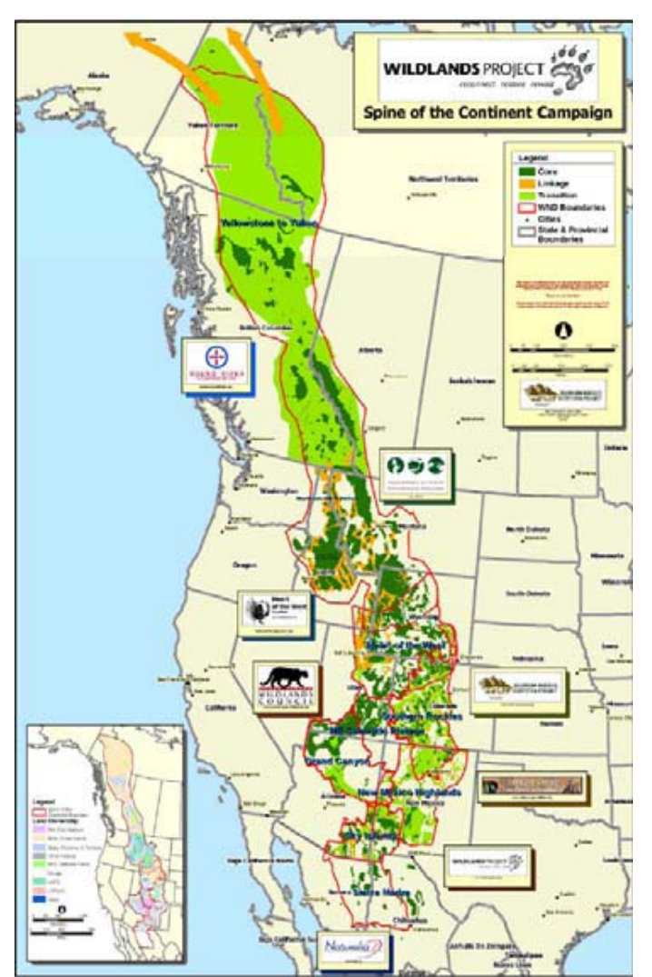
The "Yellowstone to Yukon" Wildlands/large carnivore program has been expanded to reach from northern Mexico to Alaska.